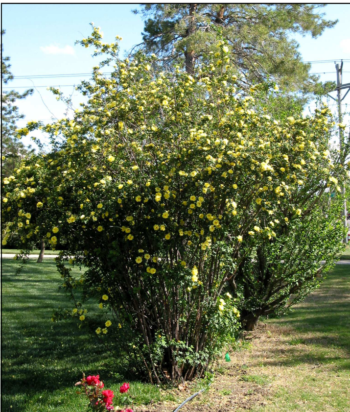
Harison's Yellow as seen in WRS member Kay Case's garden in 2010